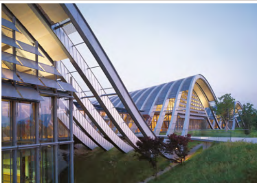
ZENTRUM PAUL KLEE IN BERN