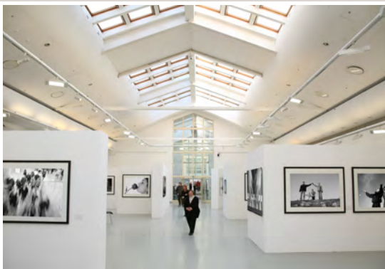
KUNSTMUSEUM IN BASEL