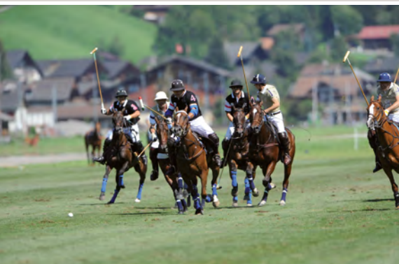
POLO GOLD CUP GSTAAD